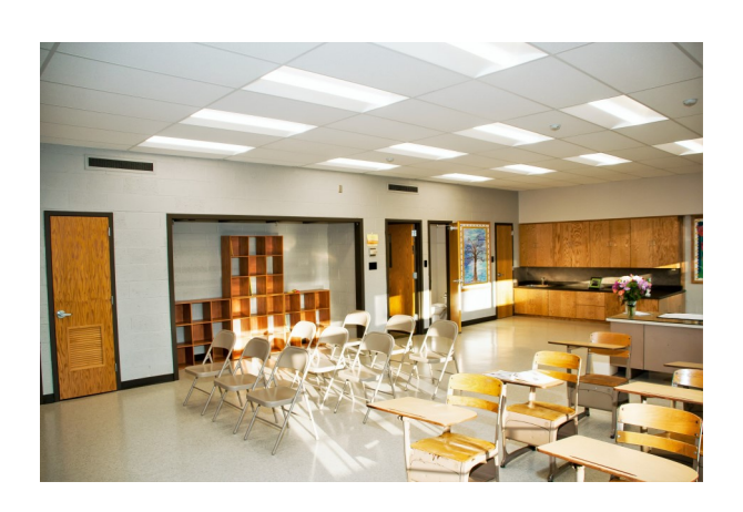
Generous donors kick-started our Interior Renewal Project in Room 203. Energy efficient lighting, new flooring, countertops, and refaced cabinets make this 21st Century Classroom ready for the next generation of students.

The first step of the Interior Renewal Project happened this summer. Room 203 was the first of 30 classrooms to have updated lighting, new teaching surfaces, refaced cupboards, new flooring, doors, counters, and paint. We need your help to renew all of the classrooms!