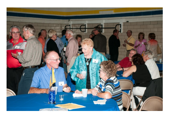
The gymnasium and first floor of Cathedral School was buzzing with fantastic conversation.