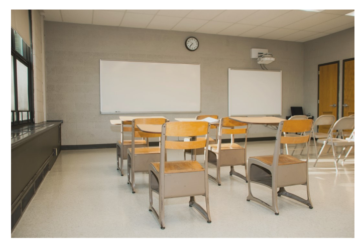
Updated writing surfaces in Room 203 include a porcelain coated white board and a SMART Board.